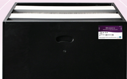
HEPA Filter for Oosafe® Air Cleaner KN