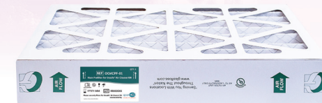
Main Prefilter for Oosafe® Air Cleaner KN